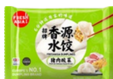
FRESHASIA Frozen Goods