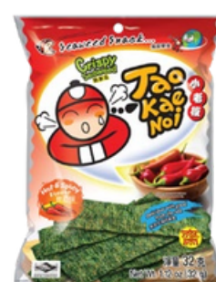
TA KAE NOI Seaweed