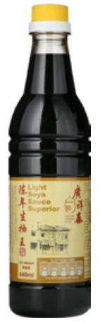
KWONG CHEONG THYE Soy Sauce