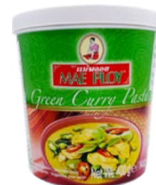
MAE PLOY Curry Pastes