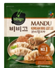
BIBIGO Frozen Goods