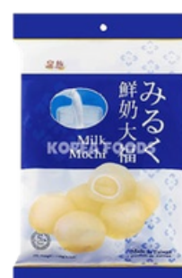
ROYAL FAMILY Mochi