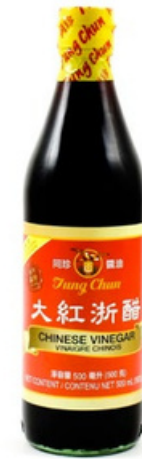
TUNG CHUN Vinegar