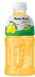
Mogu Mogu Fruit Juices