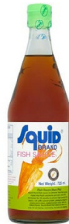
SQUID Fish Sauce