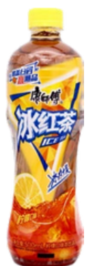
KANG SHI FU Teas