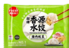
FRESHASIA Frozen Goods