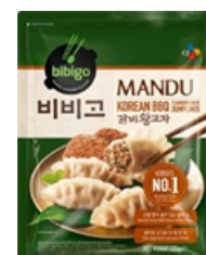
BIBIGO Frozen Goods