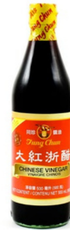
TUNG CHUN Vinegar