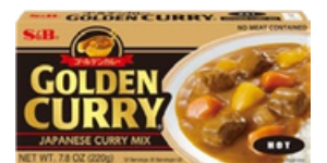
S&B Japanese Curry Mix