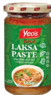
YEO'S Cooking Pastes