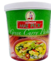
MAE PLOY Curry Pastes