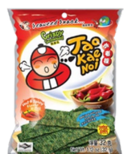
TA KAE NOI Seaweed