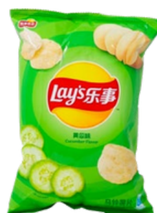
LAY'S Potato Chips

Our specialty products section offers a wide range of popular snacks and frozen goods, staying up to date with the latest trends like the growing demand for Korean products. We cater to every taste, all at honest and competitive prices.