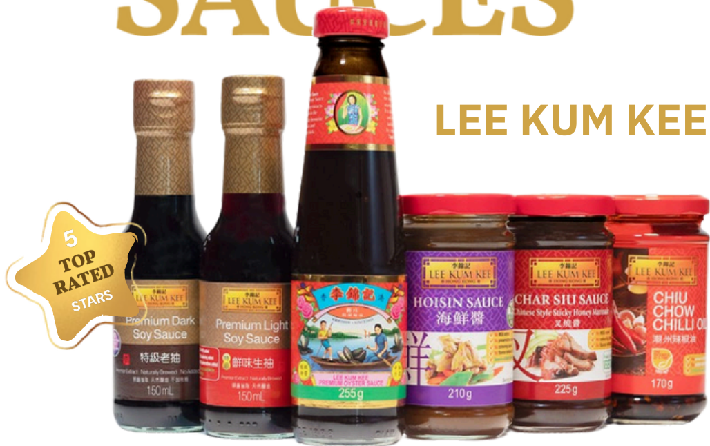
LEE KUM KEE

We provide a broad selection of condiments and sauces, including soy sauce, Thai curry paste, fish sauce, coconut milk, wasabi powder, gochujang, plum sauce, pre-made curry sauces and more.