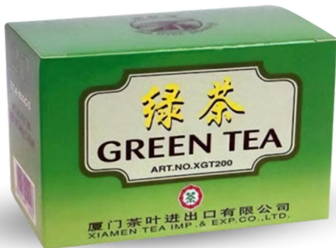
XIAMEN TEA IMP.