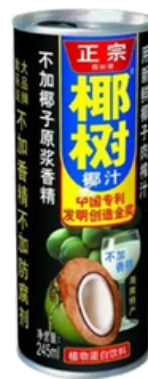
YESHU Coconut Juice