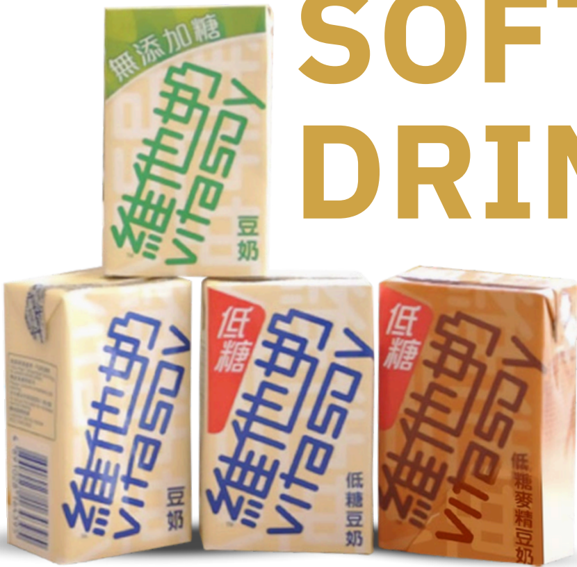
VITA & VITASOY

Our beverages section features a diverse selection of refreshing soft drinks and tea from across Asia, including favourites from Thailand, Japan, China, and Korea. Whether you're seeking traditional flavours or modern refreshments, we have something for every taste.