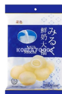
ROYAL FAMILY Mochi