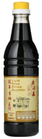
KWONG CHEONG THYE Soy Sauce